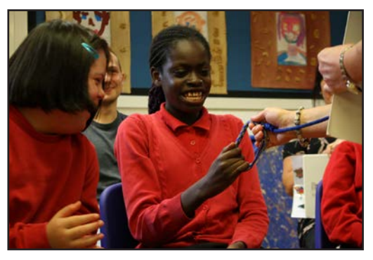
"Rick and Sally were walking their dog Patch, when suddenly, he ran off!" from Lost In London.

We can also run full-day training sessions, which include a copy of the pack, for £425.