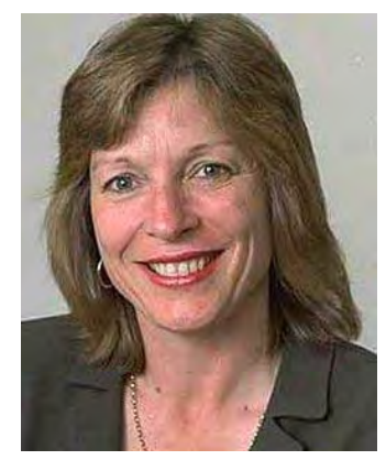
Jane Davidson, AM is Education Minister in the devolved Welsh Assembly.

BAG BOOKS HAD A SPECIAL VISITOR her some of the books on display. at the Wales Education 2004 Addysg Cymru show in May.